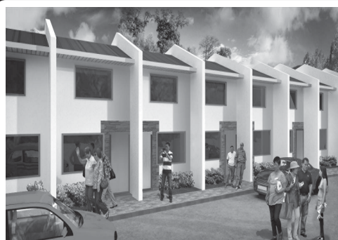
VILLA CORAZON TOWNHOUSE

This Sure Income Calendar is our roadmap to productivity. It serves as a monthly organizer and as a Calendar of Sales Activities which contain schedules of Mall Exhibits, Grand Open Houses and Follow-Up Open Houses, Sales Clinics and Business Meetings of all PRC Registered Real Estate Service Practitioners (RESP). Other schedules such as Saturation Drives and Site Mannings may be obtained from their respective Project Vice President. A. Grand Open House (GOH) : A sales activity led by the Head Office and participated by all VP offices. B. Division Choice Open House (DCOH) : A Project Open House in any of the major projects of the Head Office. Walk-ins are rotated from among the members. However, prospective buyers with a flyer from any Practitioner of a Project Vice President shall be awarded to the concerned Practitioner provided he/she is present. C. Open House (OH) : An activity participated by all the Project Vice Presidents led by Sales Directors and slotting of walk-ins by Sales Managers.