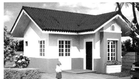
Sta. Lucia Homes / Classic BUNGALOW HOUSE MODELS