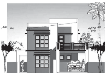
Sta. Lucia Homes / Modern TWO-STOREY HOUSE MODELS