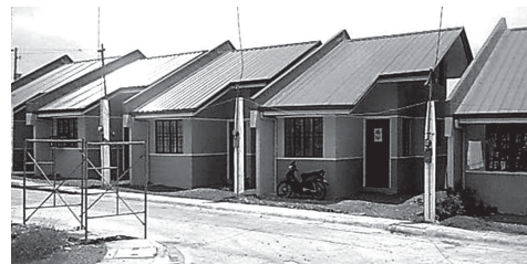
VISTA DE ORO HOUSE & LOT